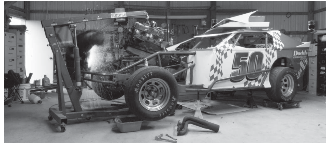
(Above) Campbell watches the Modified Series racers from the pits. (Left) The hoist holding an engine and transmission doesn't have room to move forward so Campbell cuts off the car's front bumper.