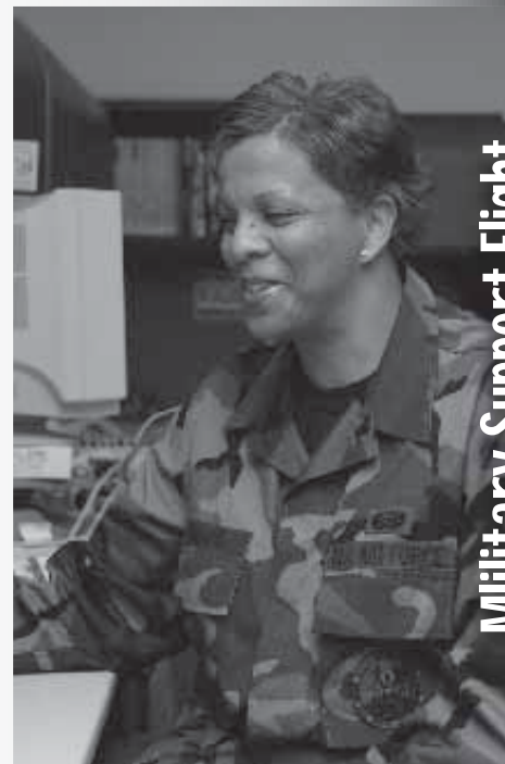
Military Support Flight

If I won $1 million, I would: Pay off our bills and invest in our future