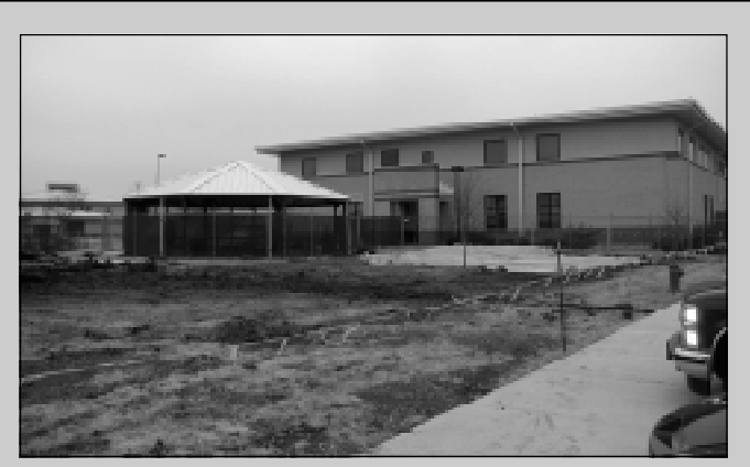
Spirit Photo by/Maj. David Fruck

Chu said the number of servicemembers on food stamps has plummeted from 19,400 in 1991 to 4,200 in 2001. An anticipated 2,100 users are expected in 2002, thanks to DOD's family subsistence supplemental allowance program that cuts down on out-of-pocket expenses. The president's budget increases funding for family support centers by 8.5 percent or $17 million.