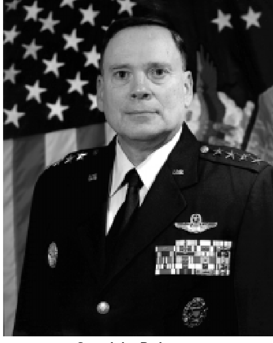
Gen. John P. Jumper

The number of people affected appears to be est extent possible.