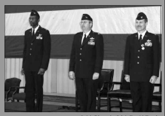
Spirit

Retired active-duty people who are interested in joining the Reserve may contact the Recruiting Opportunity Center at 1-800-295-4648 and leave information for a recruiter to call them back. More information about the program is available on the Web: www.afreserve.com/ retiree. AFRC News Service