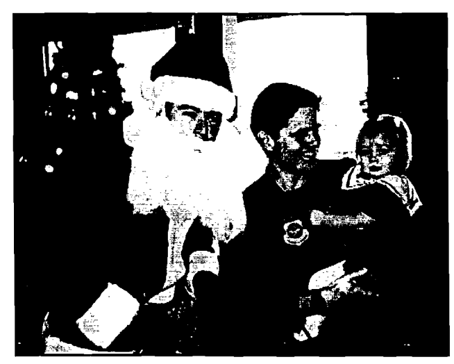
6 - January 1997 Kanza Spirit