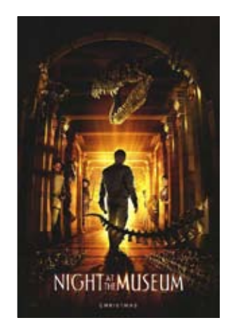
MPAA Rating: PG-13, Crude humorviolence

FRIDAY, Feb. 9 7pm 1 hr. 24 min. An amnesiac janitor, who is duped into thinking he is an undercover agent, is subconsciously carrying a secret that can link the FBI with an arms scandal.