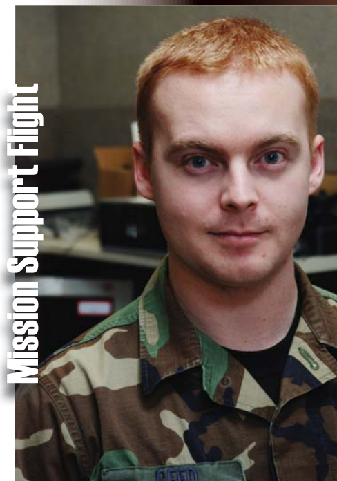
Mission Support Flight

If I won $1 million, I would: Put $900,000 in a savings plan and spend the rest like a (grown-up) child.