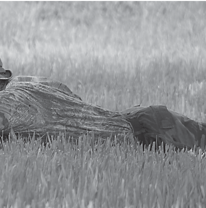
Low crawling into position. One of the bivouac opposing forces moves in for an attack during the recent bivouac.