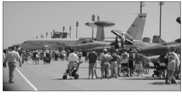
More than 50,000 people attended the annual McConnell Air Show June 16-17. In addition to the static displays of aircraft, visitors saw many aircraft in action including a reenactment of a Pearl Harbor attack by TORA! TORA!