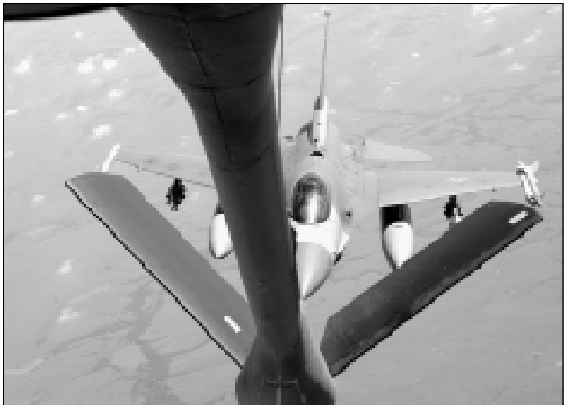
Spouses of 931st Air Refueling Group members had an opportunity to see the unit's mission first-hand June 9 during the UTA. An orientation flight allowed spouses to fly along as KC-135R crews conducted a refuelling training mission for F-16s.